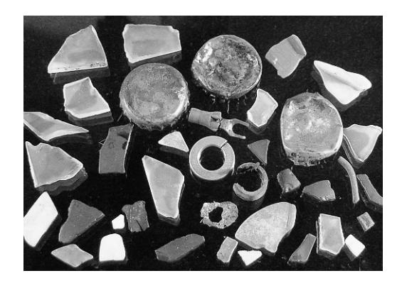
FIGURE 2. Gizzard content from condor 285. The presumed source of zinc toxicosis was the galvanized split-metal washer at center.

considered the primary factors. Four birds were killed by gunshot and another by arrow. One of the gunshot birds died of idiopathic interstitial pneumonia while being treated for a severe, open, comminuted fracture of the distal right tarsometatarsus caused by the gunshot. One additional bird had evidence of nonfatal gunshot, with shotgun pellets embedded in the body and one wing. The only confirmed infectious disease was a West Nile virus infection, complicated by secondary respiratory aspergillosis, that was the cause of death in one subadult (450) that had been vaccinated against West Nile virus (see Chang et al., 2007). Two females had ingested a variety of small trash items (see Table 2), including zinc-core pennies, which led to secondary zinc toxicosis as the immediate cause of death. Nine birds, three of them nestlings, had hepatic copper concentrations more than four standard deviations above the mean for the captive flock, but none had lesions suggestive of copper toxicosis (e.g., inanition and bile stasis in the liver). Two of them had ingested metallic trash. One bird (260) had evidence of zinc exposure but with no ingested foreign bodies present at necropsy.