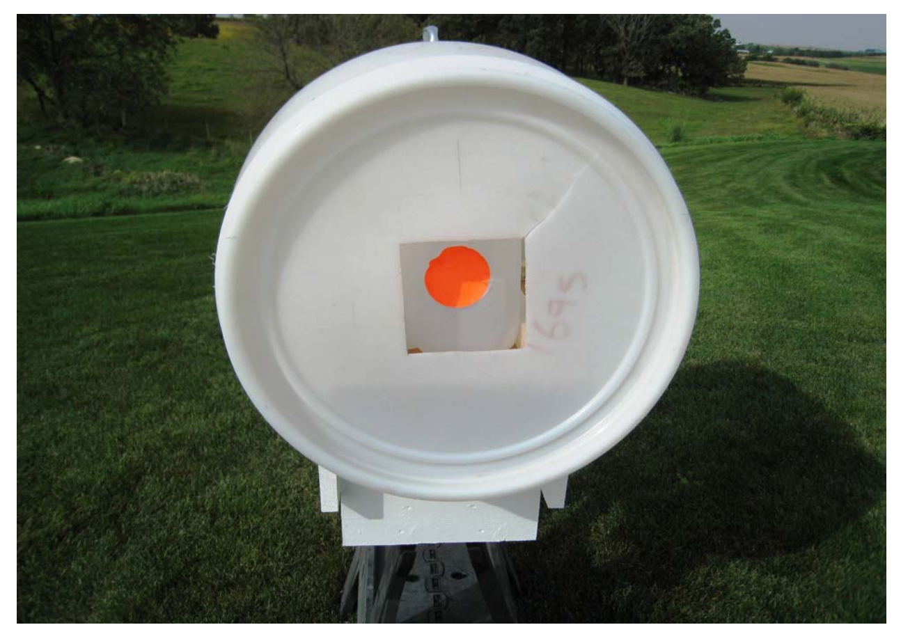
The rain barrel is now ready to enlighten many hunters about the performance of their deer hunting loads.