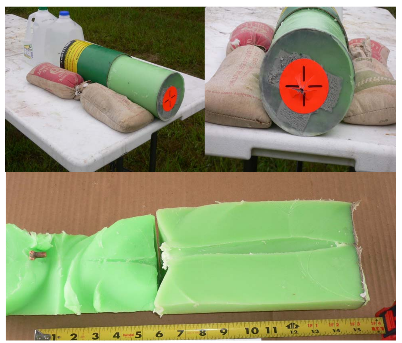
This is a 308 Win caliber Barnes 150 gr TSX bullet that penetrated 15" of the media.

We did experience day-to-day variances in the performance of the ballistics media, probably due to the above average temperatures and humidity in July and August when this data was collected.