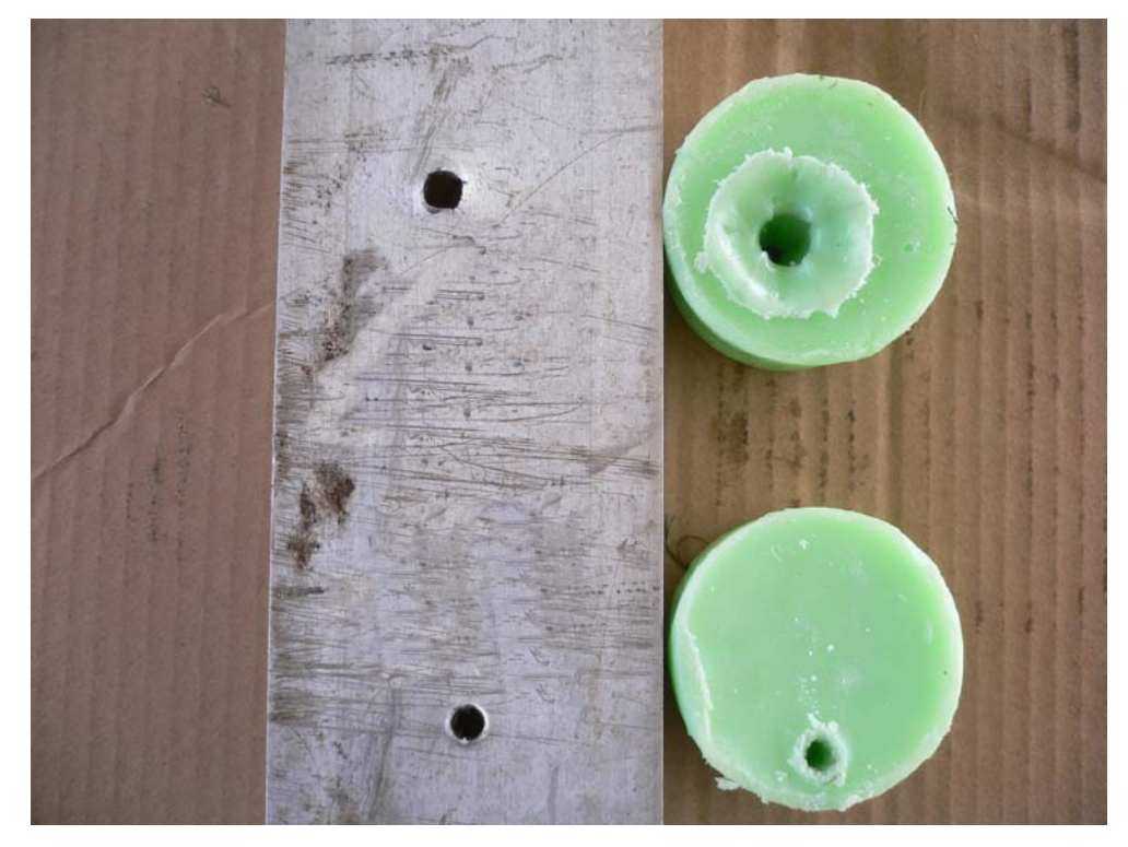
270 Winchester, 130 gr @ 1,800 fps (reduced load) 1 1/2" media + 1/4" aluminum

Top bullet is Hornady GMX. Bottom bullet is Barnes TTSX. Note the much larger exit holes with the TTSX which shows this bullet expands quickly, even at low velocities.