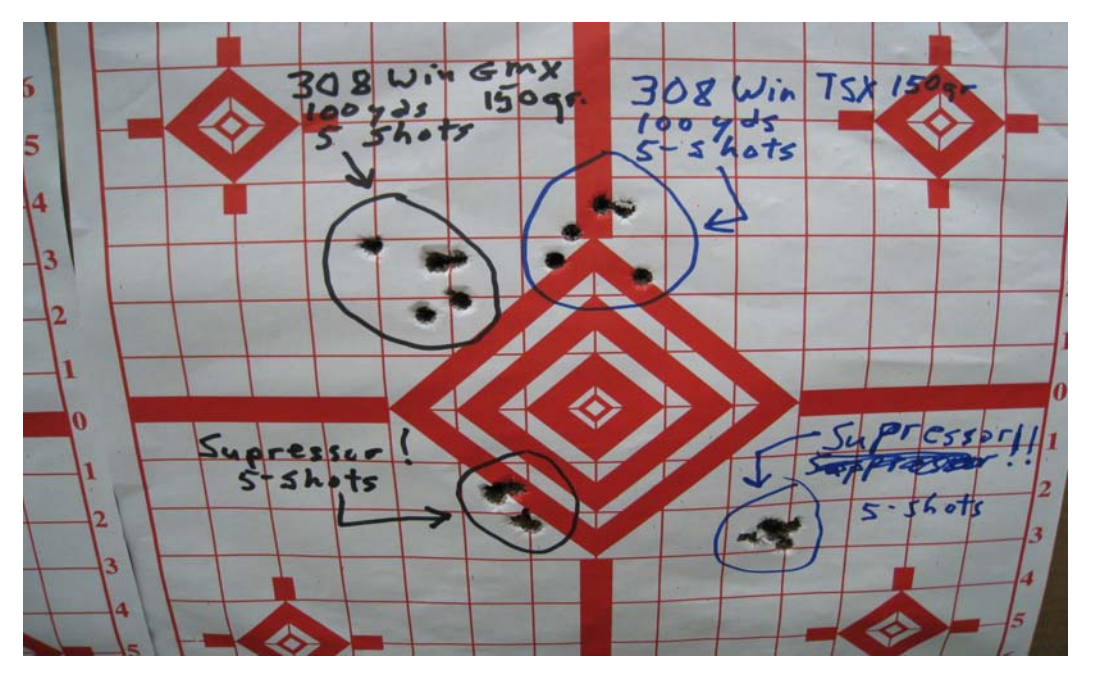
308 Win TSX and GMX 5-shot groups, with & without the suppressor, at 100 yards!!

The current ammunition for the Department 308 Winchester rifles is the Federal Premium 150 grain round with the Nosler Ballistic Tip bullet. This has been an accurate round and it has proven itself in anchoring deer in culling activities. The Barnes TSX, TTSX and Hornady GMX rounds that we tested were every bit as accurate, both with and without a suppressor. They hold together in mushrooming, retaining all their weight, unlike lead core rounds. Five-round groups shot from a bench and utilizing a " lead sled " shooting platform easily gave groups of 1½" groups at 100 yards for both Barnes and Hornady loads.