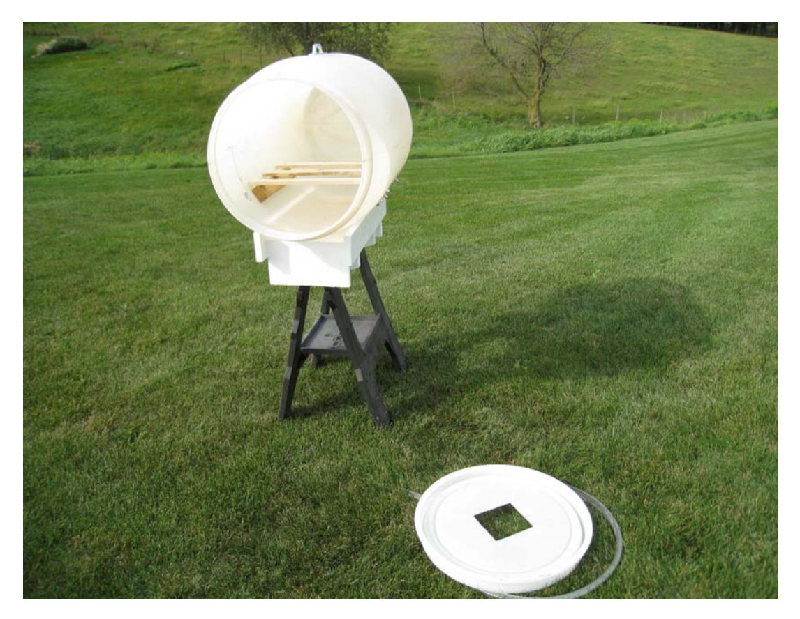
A regular 'ole rain barrel fitted to a carpenters horse works just fine.

Their break through in practical and hands-on information transfer to hunters of lead versus copper bullets inspired us to develop " a rain barrel recovery system " too. We now have a practical tool to invite hunters to come shoot their ammo and see how it performs compared to copper bullets. The rain barrel quickly allows the users to collect the bullet fragments, including lead particles for comparison with copper bullets that they just shot.