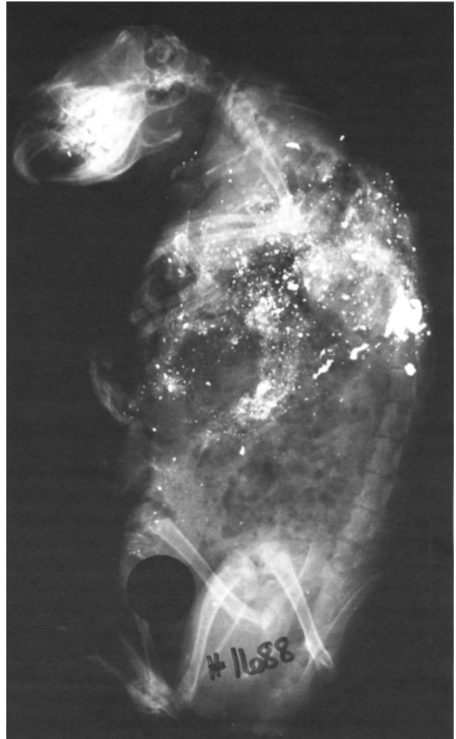
Figure 1. Lateral radiograph of a black-tailed prairie dog carcass (no. 1688) shot with an expanding bullet from a .223 caliber rifle, Thunder Basin, Wyoming, USA, 2004. Bullet fragments (white) are distributed throughout much of the carcass. In this carcass, 28.3% (774.5 mg) of the bullet core and 55.0% (449.1 mg) of the jacket was retained. We show a United States penny (diameter = 1.90 cm) for scale.

Combining the measured values with predicted values in a weighted mean ( \bar{x}_w ) revealed that 8.3% (228.4 mg) of the core, 9.1% (74.4 mg) of the jacket, and 7.5% (265.4 mg) of